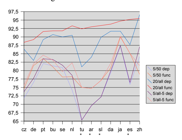
Illustration 2: Performance with different training corpus sizes (upper 2 curves: Ttest data included)

training corpus (20/all). Languages were sorted according to 5/all attachment accuracy. As can be seen from the dips in the remaining (lower) curves, small training corpora (asterisk-marked languages) made it difficult for the parser (1) to match 20/all attachment performance on unknown data, and (2) to learn labels/functions in general (dips in all function curves, even 20/all). For the larger tree-banks, the parser performed better (1-3 percentage points) for the full training set than for the 50.000 token training set.